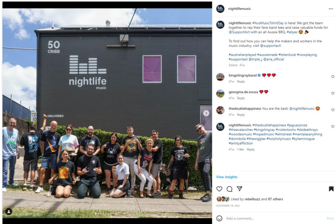
Nightlife Music's post for #ausmusicshirtday2021 [Instagram]

To learn more about Ausmusic T-shirt Day, visit the Support Act website here .